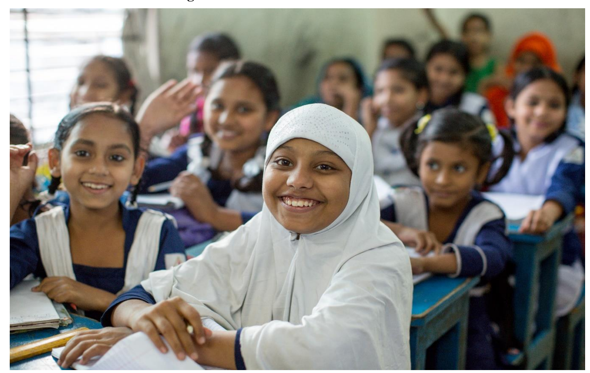
UCEP Bangladesh provides second chance education for the dropped out and never enrolled children and adolescents from the underprivileged group following the NCTB curriculum from grade I to Grade X. The students are within 10-16 years of age.

The schools offer flexible shifts to the children so that they may join the classes at their convenient time. The schools are equipped with necessary physical facilities along with qualified and competent teachers to deliver quality education. UCEP Bangladesh schools have ICT centers for all their students.